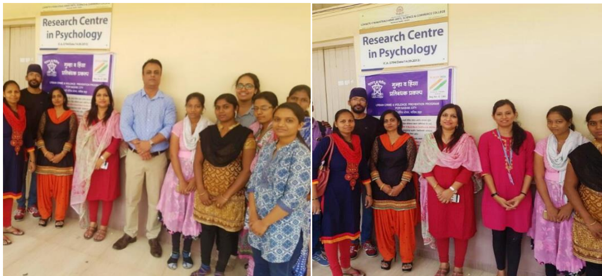
Collaborated with the NGO “Resilient India” working for Crime Prevention

The department has collaborated with the NGO “Resilient India” (Working for Crime Prevention), for conducting evaluation of the students with the help of Psychometric tests and other surveys for School / College Safety Programs and Nashik City Police. This will also help our PG students in getting sound field experience adding to their credentials. They can treat this as a Summer Project working with the NGO and Nashik City Police. Participating students will receive a Certificate of Appreciation/ Participation upon the completion of the programme.